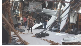
The aesthetic of ruins: Thomas Hirschhorn's In-Between installation at the South London Gallery

TAGGED ART CAMBERWELL SOUTH LONDON GALLERY WHAT'S ON IN CAMBERWELL