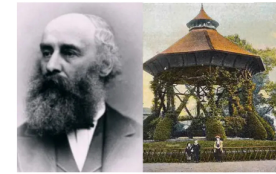
The Living Museum - The Man Who Gave South London a Breath