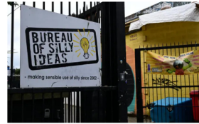
Petition launched to stop the Arch Company evicting Brixton's Club Silly and the Bureau Of Silly Ideas