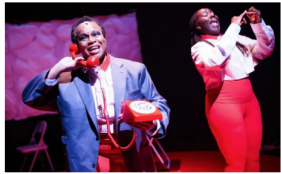
Janet Jackson focussed theatre show set for Brixton run in 19th-30th May 2026