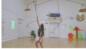
Under the Same Sun: Art from Latin America Today at the South London Gallery, Camberwell